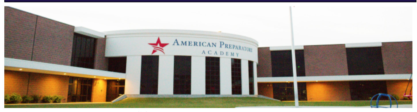
NOVEMBER BUILDER THEME: "I Am A Builder When I Express Gratitude in Word and Deed."